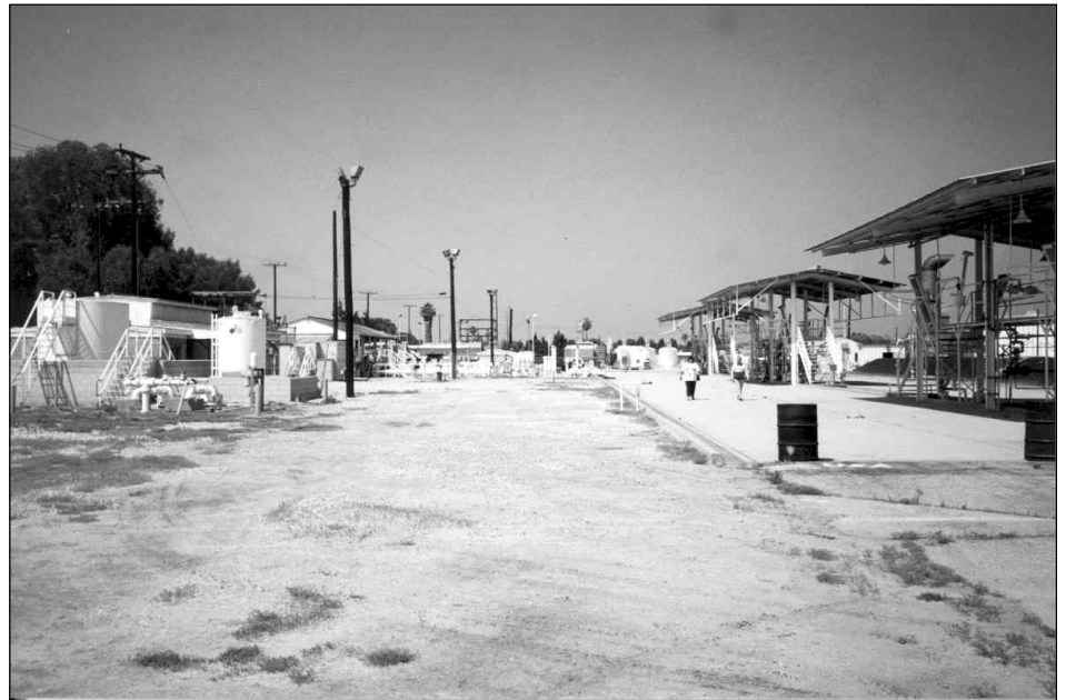
Truck Fill Stand Investigation. A soil investigation was conducted in the Truck Fill Stand Area (shown here on the right).

This area was not previously investigated because of its location on a concrete pad and its potential need in emergencies. With the closure of the Tank Farm, soil sampling was performed to evaluate the potential need for cleanup in the area. A limited amount of residual fuel from previous operations was discovered in the unsaturated zone between the second and third truck racks, but no significant contribution