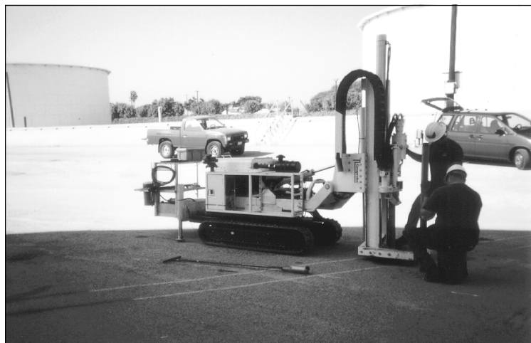
Air Sparging. The installation of air sparge wells (shown here in 2000) has enhanced cleanup.

The fact sheet included information on system enhancements conducted over the past year to improve the cleanup operations. The latest groundwater monitoring reports show that the system enhancements have been successful. Overall chemical concentrations have dropped significantly.